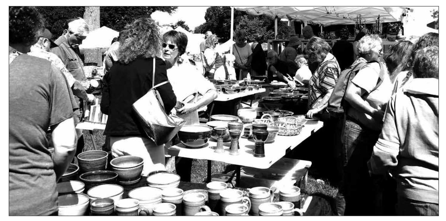
Photo of the Month: Visitors to the Flint Institute of Arts' annual Flint Art Fair peruse tables full of area artists' work on June 8, 2024.