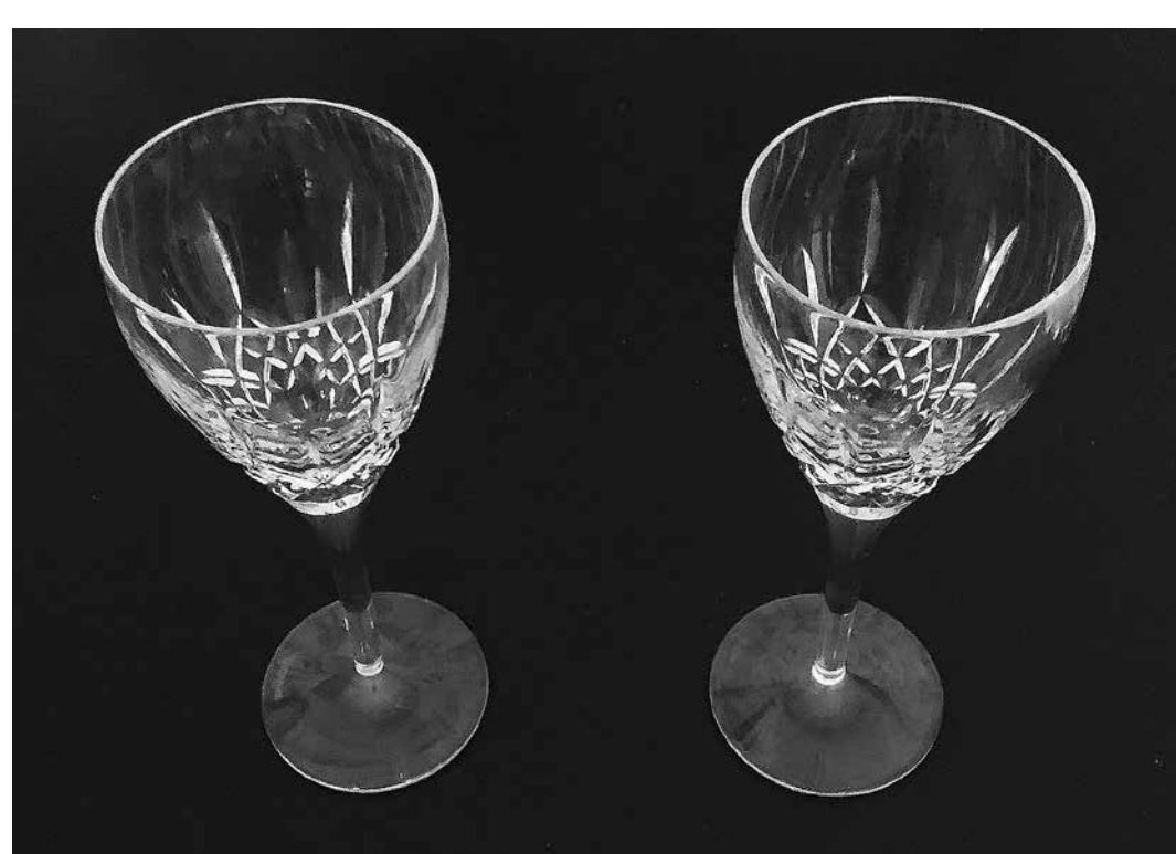
Jan Worth-Nelson's treasured Waterford glasses.

on the sanded wood top (Continued on Page 11)