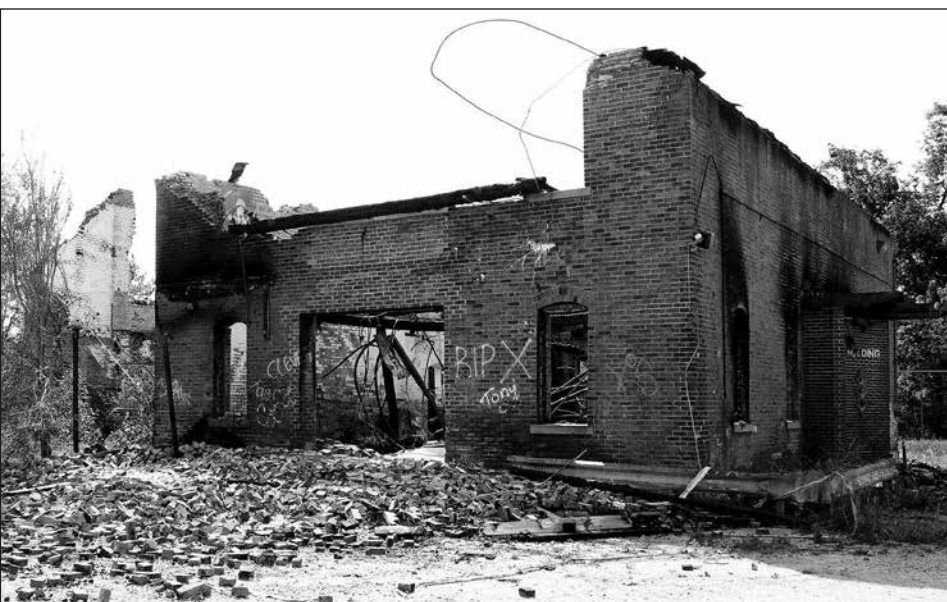
The former Apprentice Building on the abandoned Central-Whittier campus in Flint

• At about 11 p.m. on Saturday, May 11 a fire was reported at a building on the aban-